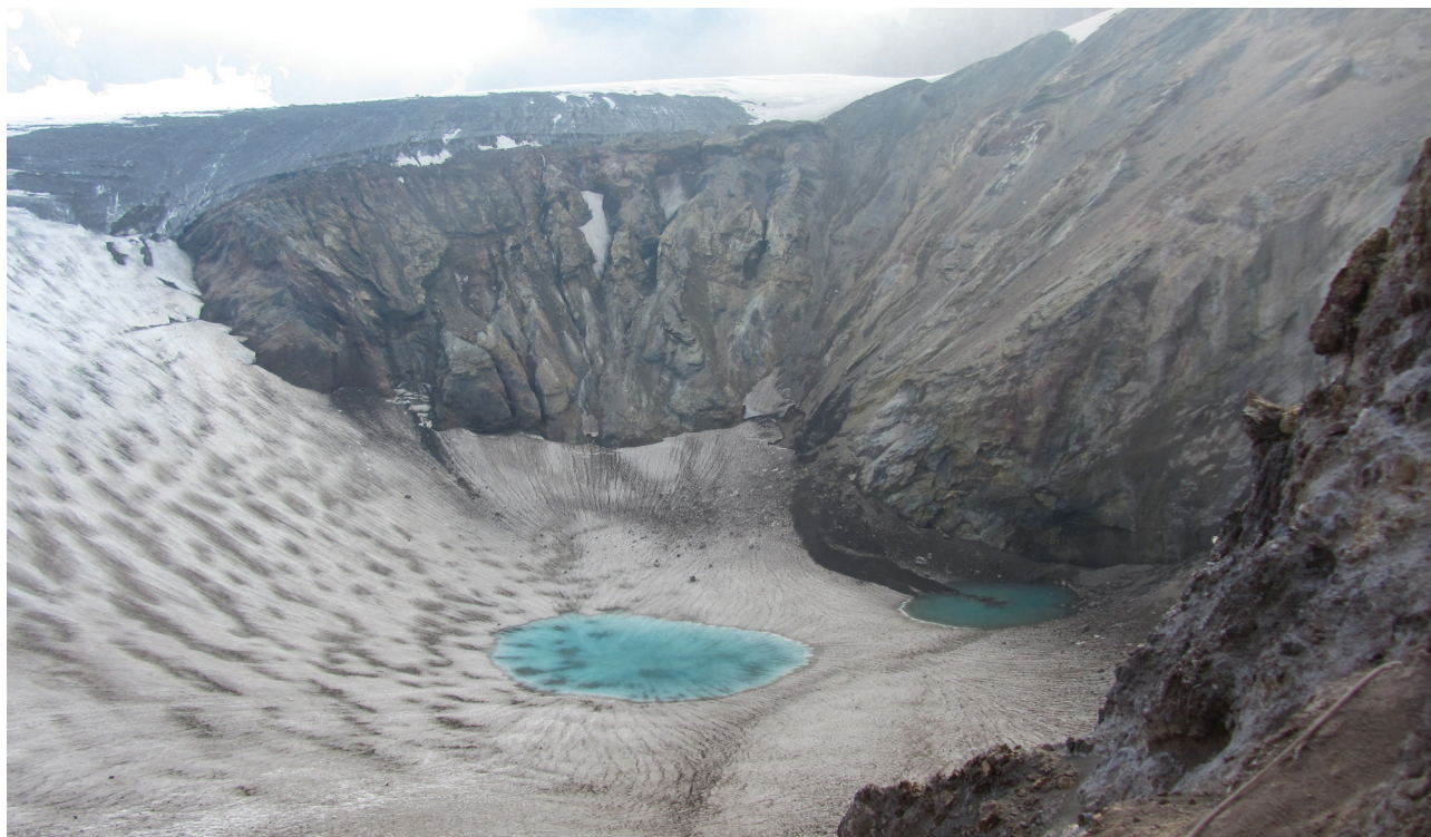
Fig. 2. Glacial lake in the South-Western crater of Mutnovsky Volcano, August 25, 2018.

From April 2, 2018, satellite images obtained and processed in KVERT (Kamchatkan Volcanic Eruption Response Team) ( http://www.kscnet.ru/ivs/kvert/ ), bear evidence for thermal anomaly within the Active Crater of the volcano, which we believe is associated with the crater lake (fig.3). On May 15, 2018, the high