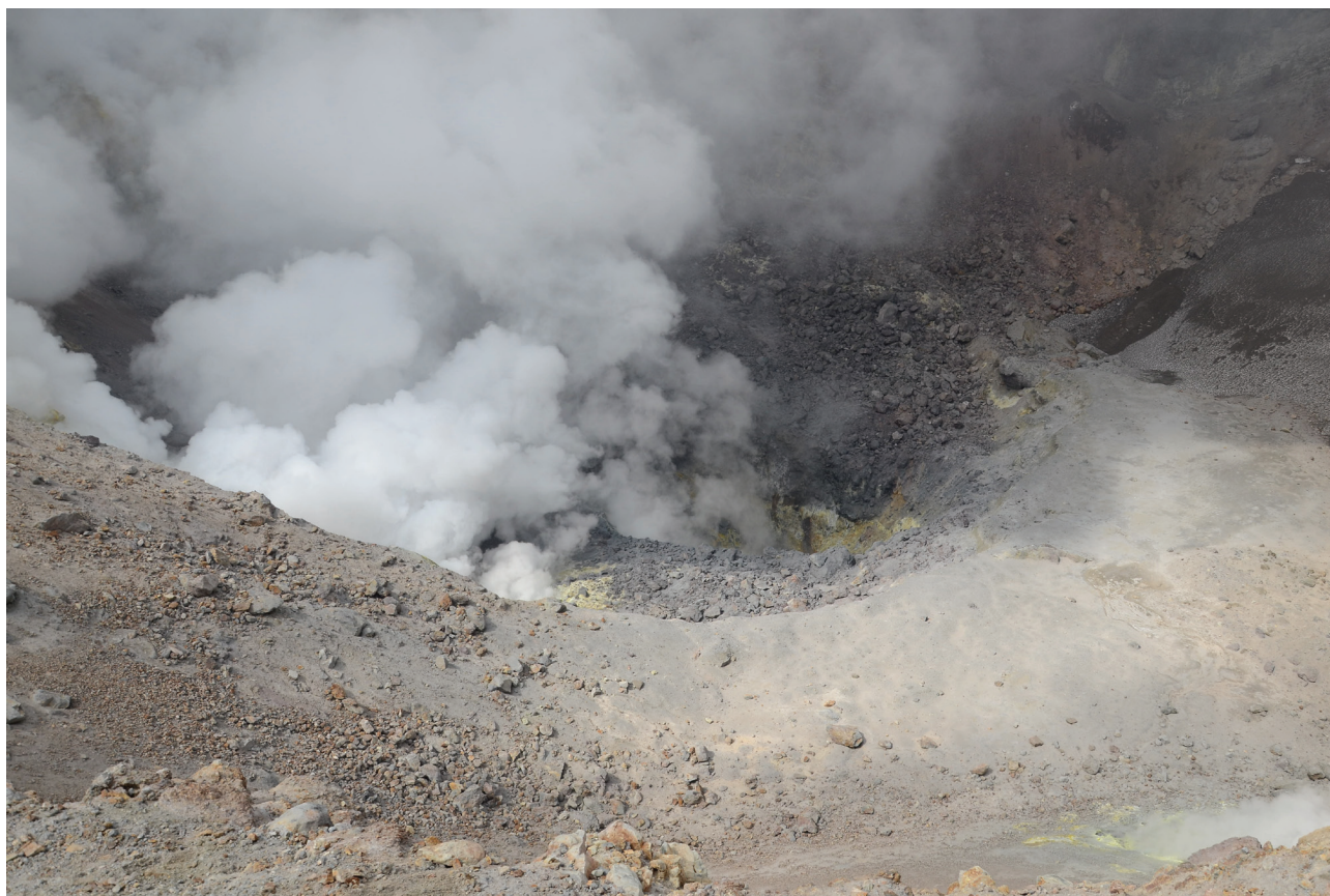
Fig. 4. Explosive crater at the bottom of the Active Funnel, August 2, 2013.