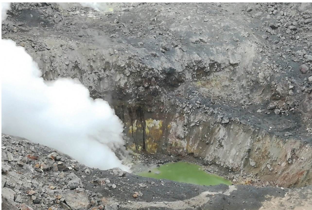
Fig. 5. Crater lake inside the Active Funnel of Mutnovsky Volcano, August 25, 2018.