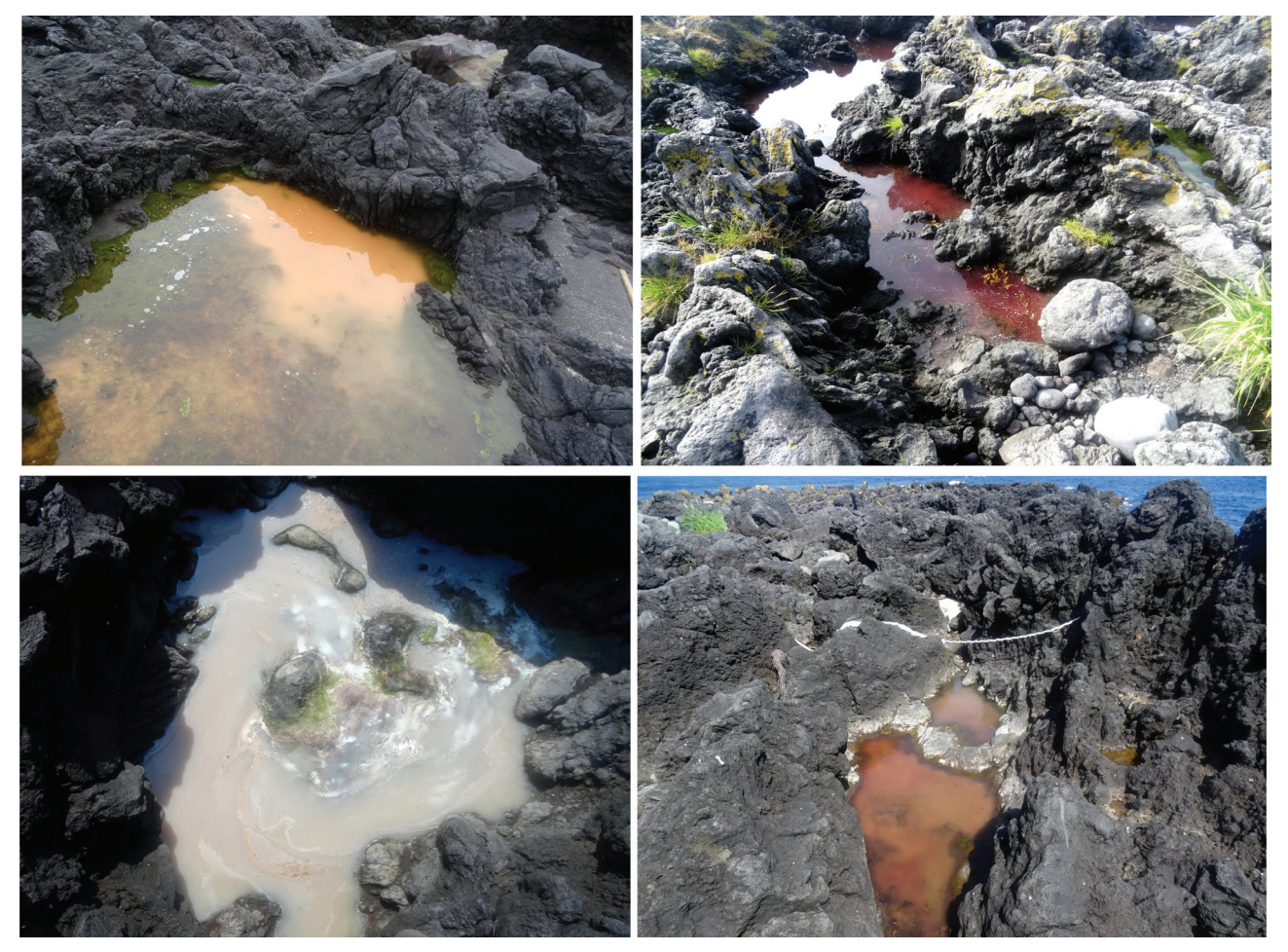
Fig. 6. Splash pools with «coloured water» on lava flows.