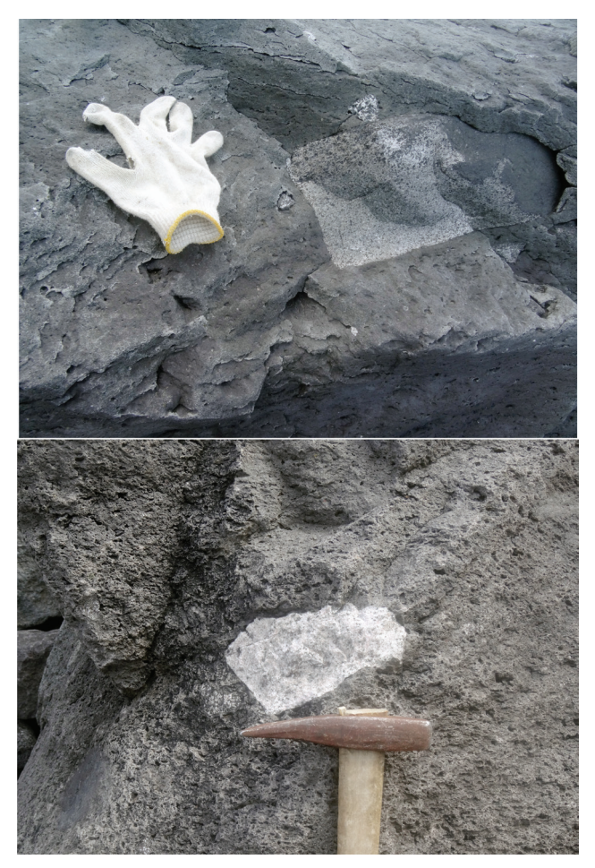
Fig. 3. Xenoliths.

August 11, 2019 it was sending emissions from the active crater with intervals of 50–60 minutes (Fig. 8, 9).