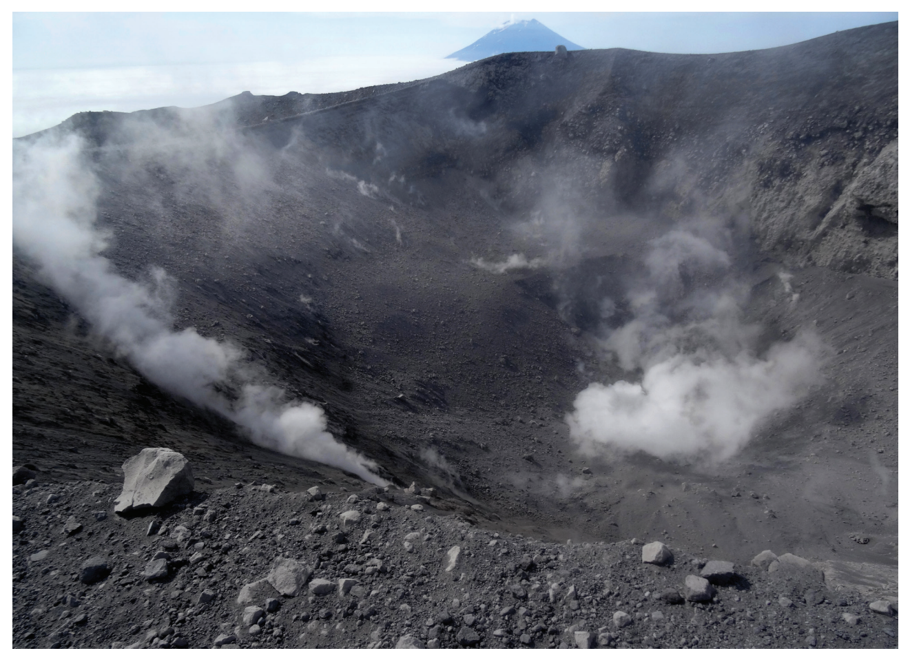
Fig. 9. The August 11, 2019 active crater at Ebeko Volcano.