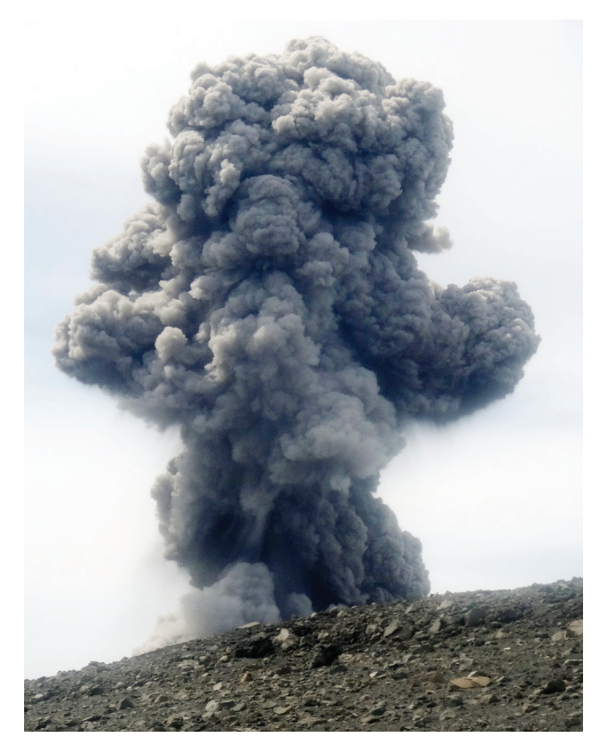
Fig. 8. The August 11, 2019 ash emission at Ebeko Volcano.