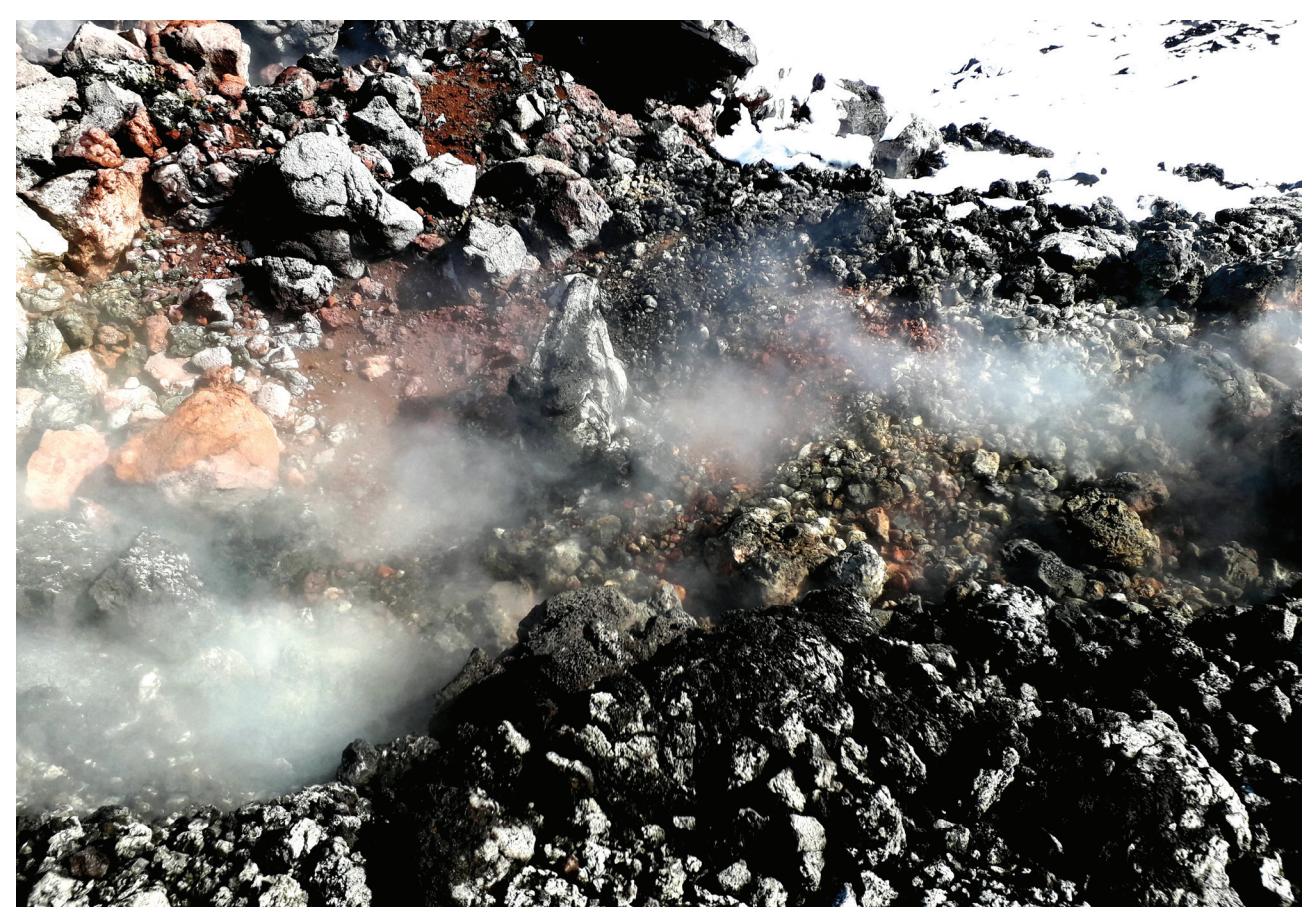
Fig. 11. Fumarole activity in the crater of Alaid Volcano.