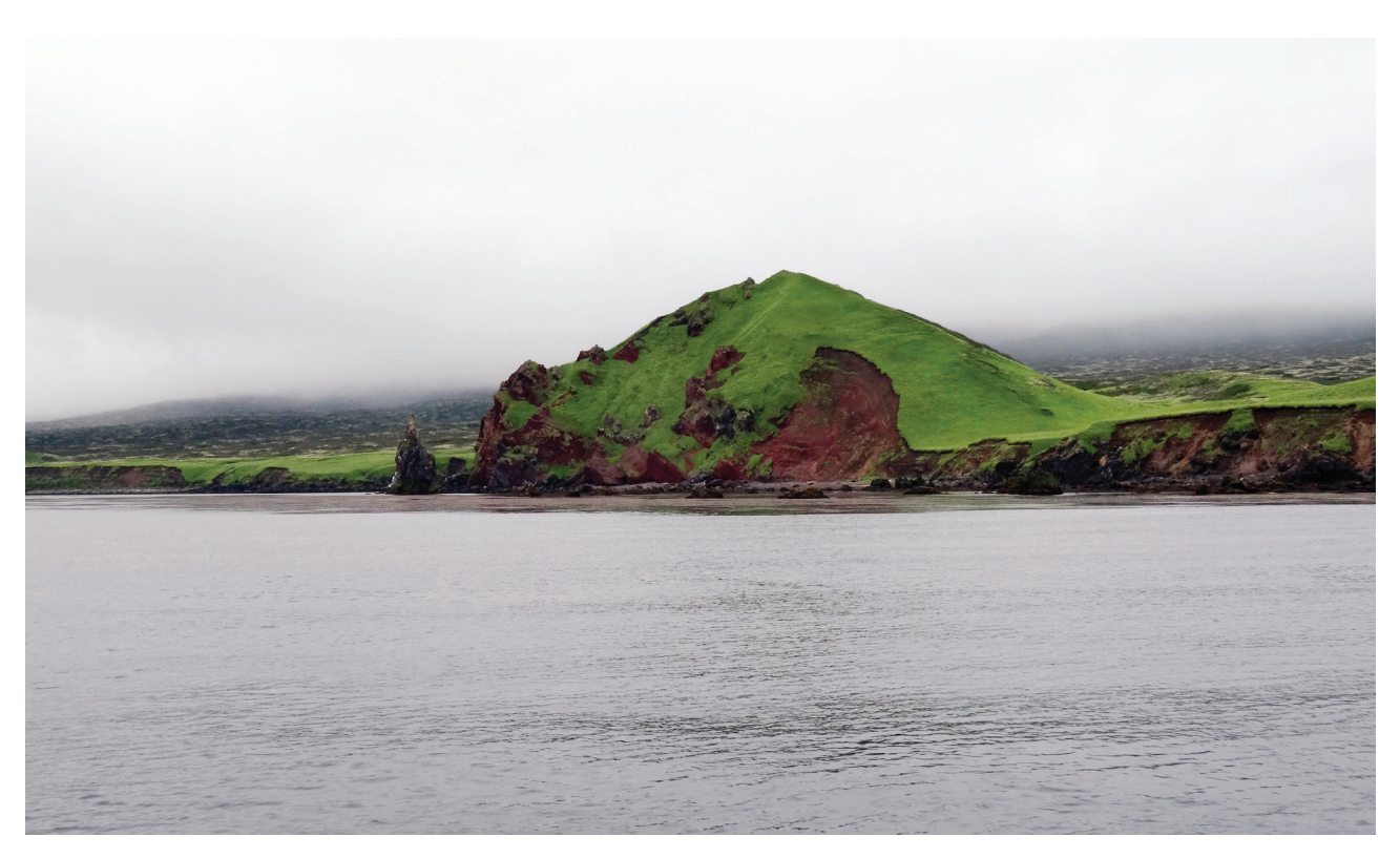
Fig. 5. The Khitryy Cape.