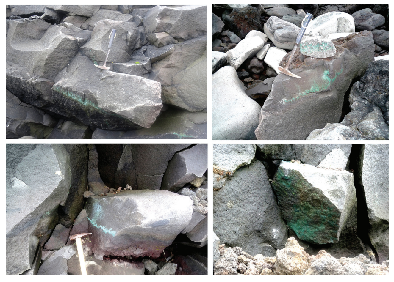
Fig. 4. Cu occurrences.