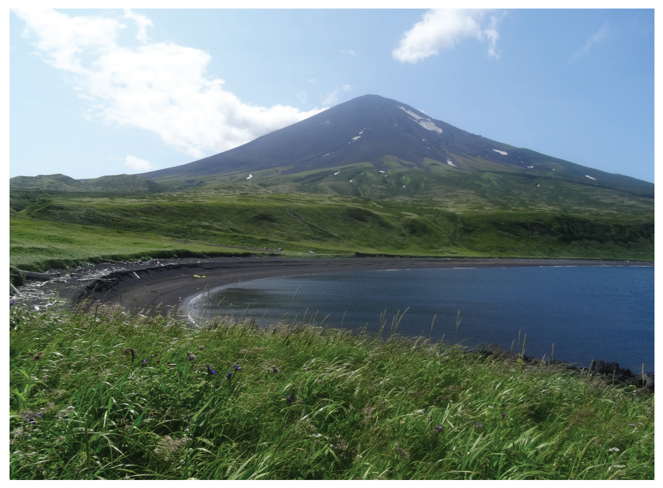
Fig. 2. Severnaya Bay.

As it was noted in previous works of Rashidov, Anikin, 2016, despite the large number of streams shown on geographical maps and maps in GPS navigators fresh water is practically absent within the Alaid Volcano research area. There are only overgrown with vegetation stream-ways in the designated Brooks places.