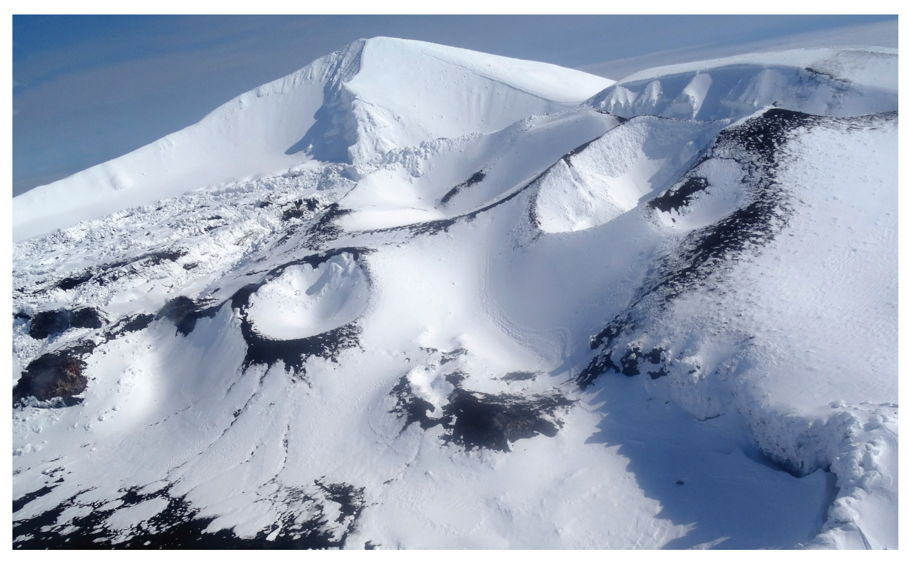
Fig. 10. The 29 September, 2019 Alaid Volcano Crater.