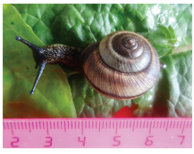
Fig 7. Land snails of the Bradybaenidae family.