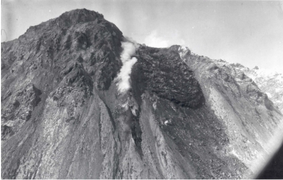
Fig.1. A viscous lava flow of Bezymianny volcano first was noted in 1977.

2 Institute of Volcanology and Seismology FED RAS, 683006 Petropavlovsk-Kamchatsky, Russia