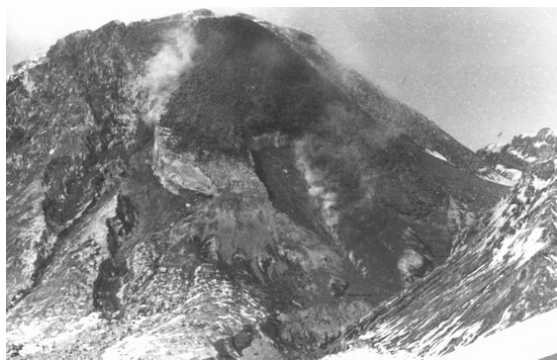
Fig.2. An activity of the lava flow of Bezymianny volcano on March 1990.